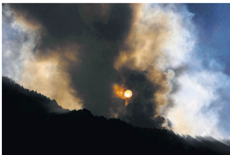
The sun rises during a forest fire on El Cable Hill in Bogota, Colombia, Thursday, Jan. 25, 2024.

He added that India is committed to making sure its migrant workers are safe and protected. □